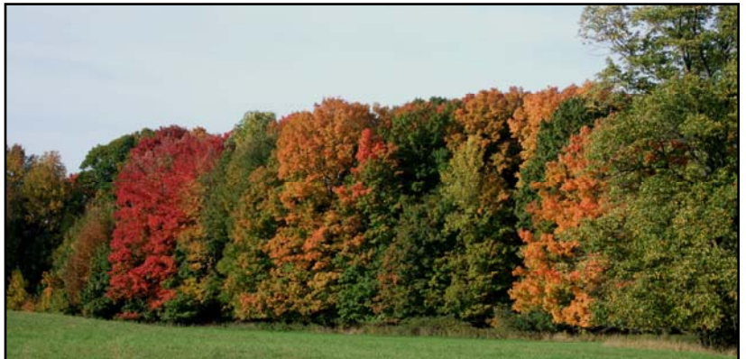
Sugar maples in the fall.

The Rio Creek Woodlands Habitat Area has been identified as Conservation Priority Site by Glacial Lakes Conservancy and now by the Wisconsin DNR because of its many outstanding qualities. Glacial Lakes Conservancy is available to work with willing landowners in this area who wish to engage in land conservation practices while keeping the land private.